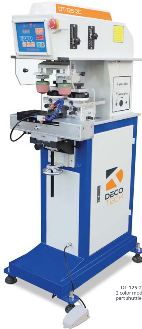
DT-125-2C-PS 2 color model with part shuttle shown

ECONOMICAL 1 TO 2 COLOR PAD PRINTING MACHINE