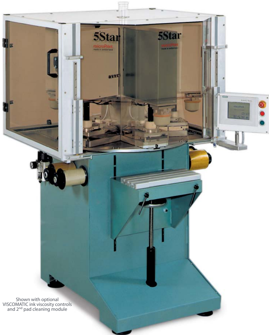
Shown with optional VISCOMATIC ink viscosity controls and 2 nd pad cleaning module

1 TO 5 COLOR ROTARY INDEXED PAD PRINTING WORKSTATION