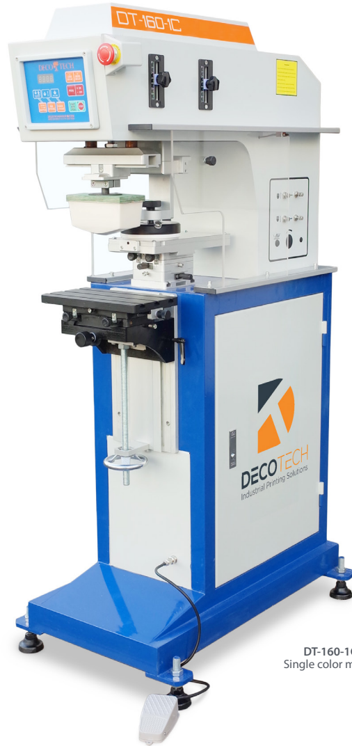
DT-160-1C Single color model