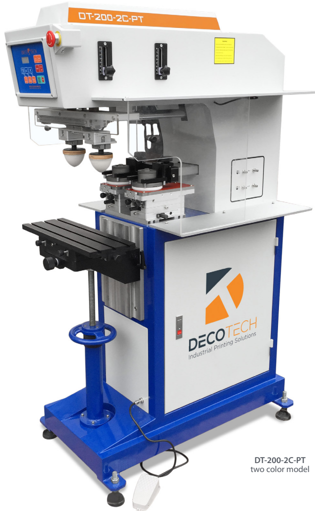
DT-200-2C-PT two color model