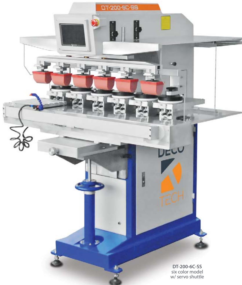
DT-200-6C-SS six color model w/ servo shuttle

PROGRAMMABLE 1-6 COLOR SHUTTLE PAD PRINTING MACHINE