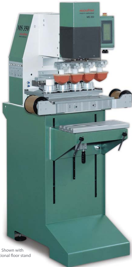
Shown with optional floor stand

MODULAR 1 TO 6 COLOR PAD PRINTING WORKSTATION