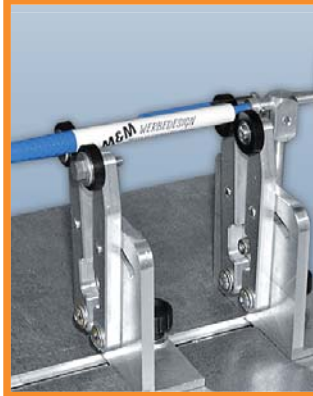
Shown with tooling for small round objects such as pens