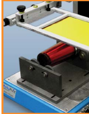
Shown with custom tooling & screen frames for handled mugs