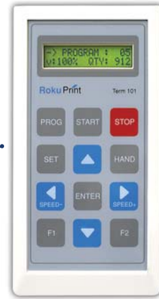
User-friendly handheld controller makes programming and set-up a simple task