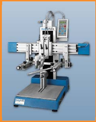
Shown with rack & gear drive system (RD 03) for round objects